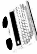
Ultratec Superprint 4425 TTY

This TTY includes sophisticated capabilities including: direct connect with two built-in telephone jacks, auto-busy redial, three way-calling, auto-answer, and TTY transfer.