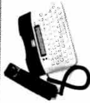
Ultratec Uniphone 1140

The Uniphone 1140 combines a telephone, full featured TTY, and an amplified phone in one compact unit.