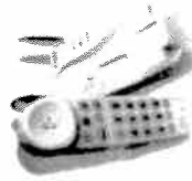
Clarity Professional® C4205 (TM) Moderate to Severe Hearing Loss

Featuring Clarity® Power™ technology which makes telephone conversations louder, clearer and easier to understand.