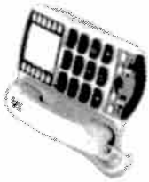
Ameriphone XL-40 Mild to Moderate Hearing Loss

Choose one telecommunications device that best suits your hearing loss needs.