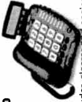
ClearSounds® CS-C50 Moderate to Severe Hearing Loss

The CS-C50 makes conversations louder, clearer and easier to understand.