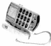
Ameriphone XL-50 Moderate to Severe Hearing Loss

The XL-50 makes conversations louder, clearer and easier to understand. Same features as Ameriphone XL-40, with additional amplification.